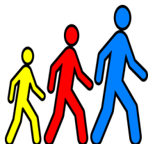
Walkers at Dismissal