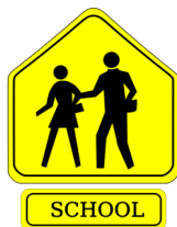
Arrival & Dismissal Safety